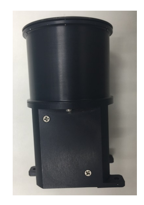
1.5 Navigational devices main_view.jpg